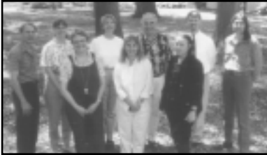
Open Campus Faculty and Staff Initiative Team Santa Fe Community College