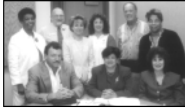
The Odyssey Oversight Committee Miami-Dade Community College