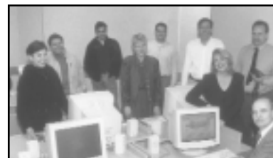
The Educational Technology Center Staff Johnson County Community College