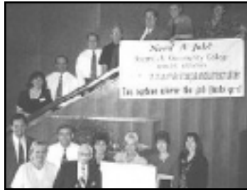
The winning team from Maricopa Community College District